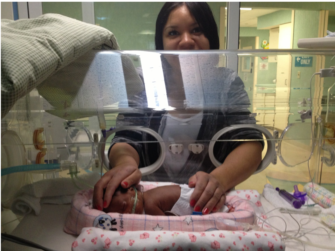
Mom and baby

In the NICU, we observe babies, because their behaviors can tell us what is stressful for them, or what they find to be comforting. The following information is provided to introduce to you the age-appropriate characteristics and behaviors you may see in your infant, as well as appropriate supportive care we can provide.