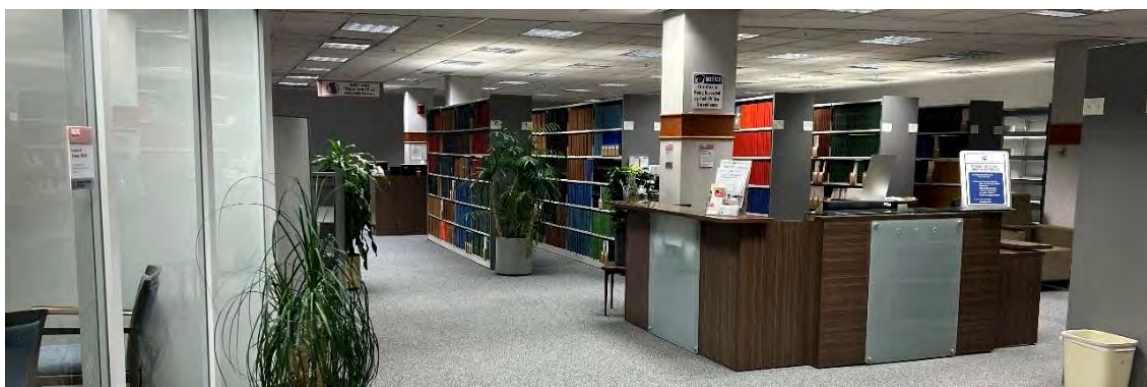
Pictured above is the Harold H. Brittingham Memorial Library.