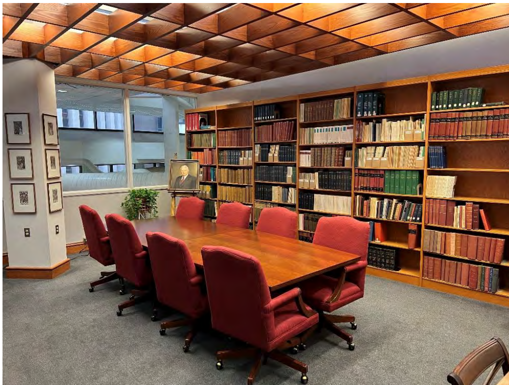
Pictured above is Stecher Reading Room (R274), located in the Harold H. Brittingham Memorial Library.