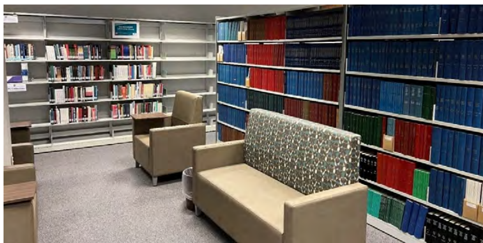
Pictured above is the Harold H. Brittingham Memorial Library.