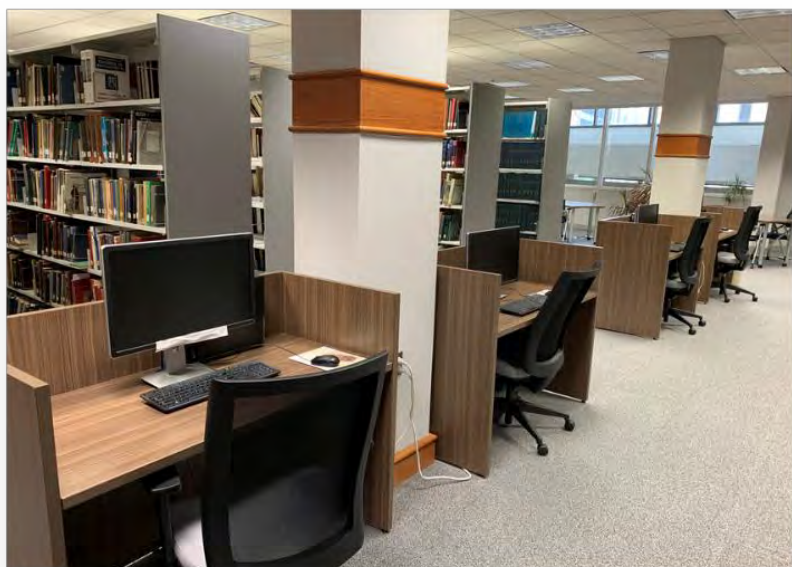
Pictured left: Four of the seven computer workstations are available for searching the Library databases and the internet in the back of the Brittingham Library.

*COUNTER Compliant data; platform master report