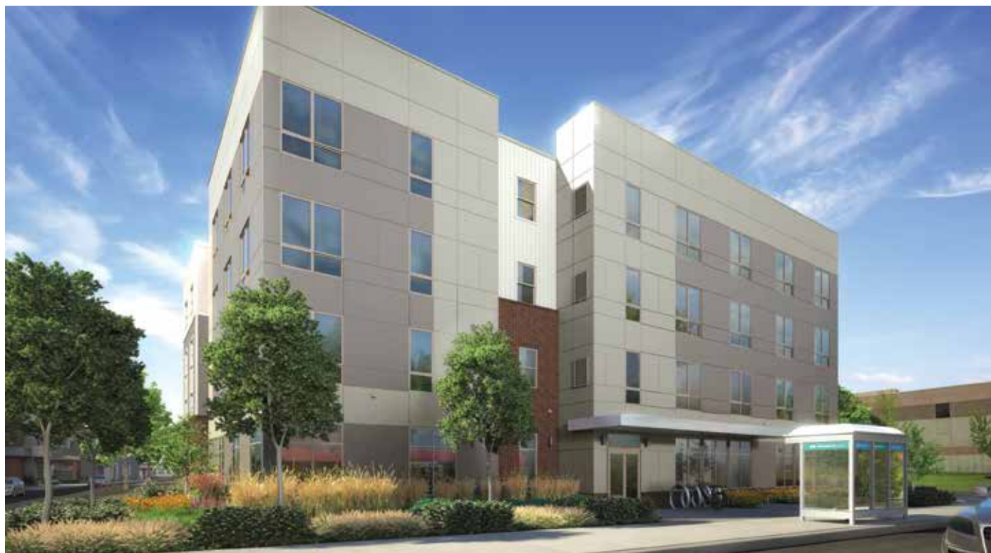
Rendering of the Via Sana building, which will house the MetroHealth Economic Opportunity Center.