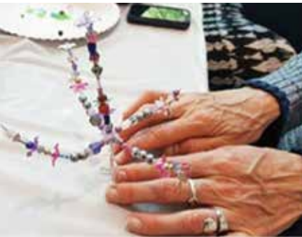
Pictured: The Arts in Medicine Program taught patients how to create "Hope Trees."

Nearly 150 patients attended The MetroHealth Cancer Center's 2016 Cancer Survivors Day celebration on June 6. The event included bingo, prizes, music and crafts. Patients also had an opportunity to register for the American Cancer Society's Relay for Life.