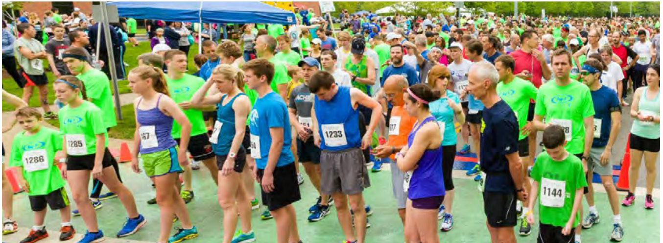
More than 900 people participated in the seventh annual Hy-5: The Hyland 5K Run & 1 Mile Walk in May.