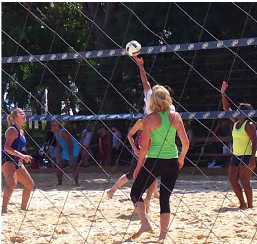
Co-ed teams played to win – and raise money – at Whiskey Island in August.

The second annual Raising the N.E.T.s Volleyball Tournament, held on August 15, 2015, at Whiskey Island, raised more than $5,700 for the Aamoth Family Pediatric Wellness Center at MetroHealth. Seventeen co-ed teams played in the tournament, a fundraising event of the MetroHealth N.E.T. Council of Emerging Professionals.