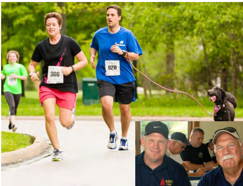
The seventh annual 5k Run & 1 Mile Walk, hosted by Hyland Software Inc., raised $30,000.