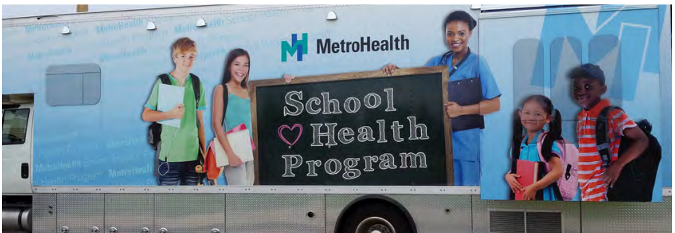
School Health Program mobile unit

Following the event, several attendees made generous donations to the School Health Program. Among the gifts was a $250,000 grant from the Char and Chuck Fowler Family Foundation to be used toward operating expenses and the purchase of a second mobile unit.