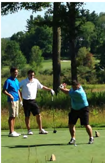
Golfers at the Altieri Golf Outing