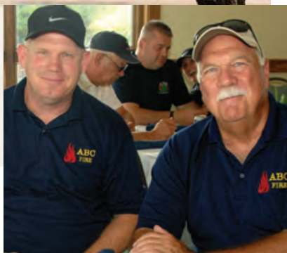
Members of the ABC Fire Inc. golf foursome at the Gannon Memorial Golf Tournament.

More than 120 golfers took part in the 2015 Gannon Memorial Golf Tournament at Briarwood Golf Club in Broadview Heights on June 15, 2015. The event raised $50,000 for medical care and support services for trauma patients and patients in the John A. Gannon Comprehensive Burn Care Center at MetroHealth. Since 1998, the tournament has raised more than $729,000.