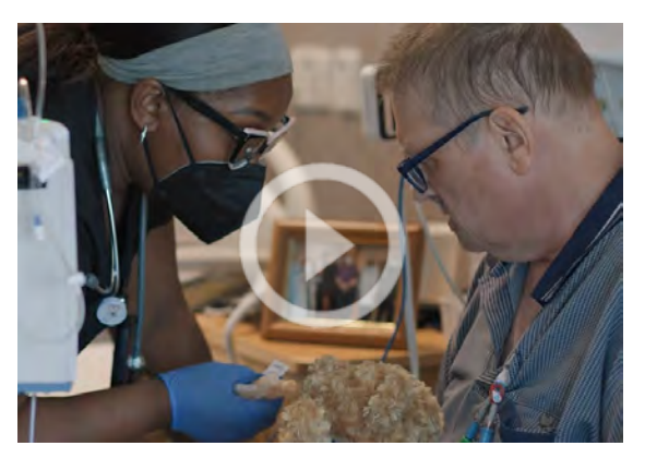
Bone Marrow Transplant Program