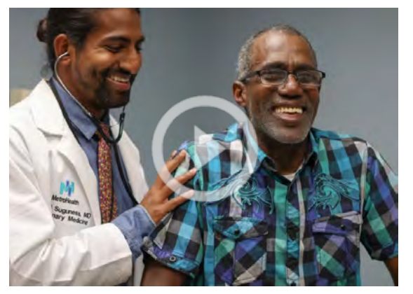
First Zephyr Valve Recipient